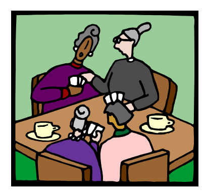
Fourth from your longest and strongest, Mabel... My coffee is getting cold waiting for you to choose!